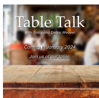
Table Talk – In the midst of the reformation, Martin Luther hosted students and friends around his dinner table. The discussions, called Table Talks, ranged widely from the intensely personal, through the political and pastoral, to theology and the Bible. In the spirit of Luther's Table Talks, we invite you to join us at our "Zoom Table" the Second and Fourth Thursday of each month beginning in February 2024. Our desire is to provide a casual, safe place to ask questions, probe issues, think deeply, talk about Jesus, and laugh together.

PrayerLife – For more than a decade, PrayerLife has invited listeners into God's presence for 90 seconds to intercede for families, churches, cities, the nation and the nations. PrayerLife is heard daily on KXRA (Minnesota) and WAVA (Washington DC). You can also access PrayerLife on Spotify, iHeart Radio, Google Podcast, Apple Podcast, and Amazon Music.